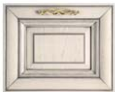
crema (opz. P08R) cream