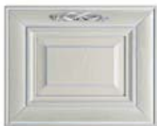
canapa (opz. P12A) hemp