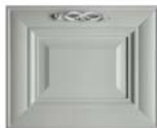
grigio chiaro (opz. P40P) light grey