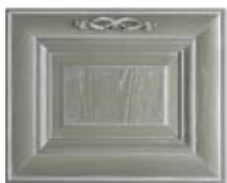
oliva (opz. P20A) olive