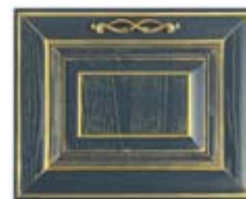
grafite (opz. P46D) graphite