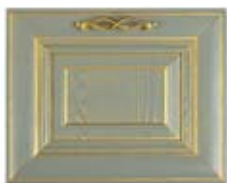
oliva (opz. P20D) olive