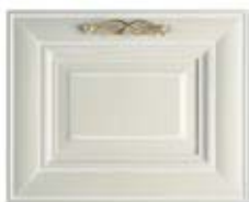
canapa (opz. P12B) hemp