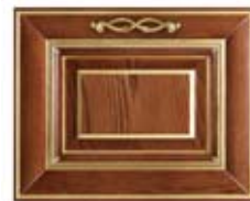
tinto ciliegio (opz. P32D) stained cherry