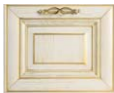
crema (opz. P08D) cream