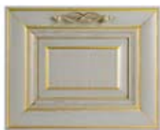
grigio chiaro (opz. P40D) light grey