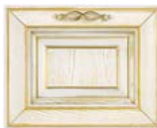
bianco ghiaccio (opz. P05D) ice white