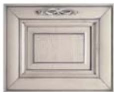
argilla (opz. P15R) clay