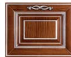
tinto ciliegio (opz. P32A) stained cherry