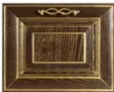
carruba (opz. P30D) carob