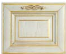
canapa (opz. P12D) hemp