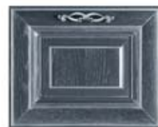
grafite (opz. P46A) graphite