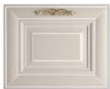
argilla (opz. P15RB) clay