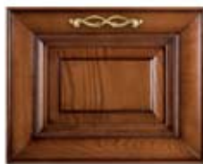
into ciliegio anticato (opz. P32P) stained antique cherry