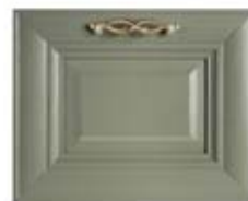
oliva (opz. P20P) olive