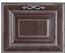
carruba (opz. P30A) carob