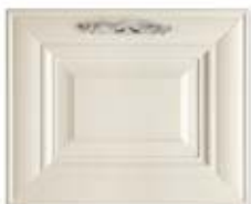
crema (opz. P08P) cream