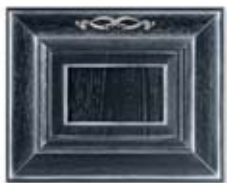
nero (opz. P50A) black