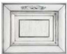
bianco ghiaccio (opz. P05R) ice white