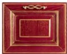
rosso (opz. P25D) red