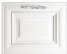
bianco ghiaccio (opz. P05P) clay