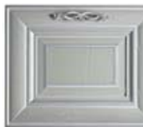
grigio chiaro (opz. P40A) light grey