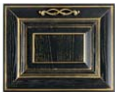
nero (opz. P50D) black