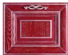
rosso (opz. P25A) red