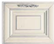
crema (opz. P08A) cream