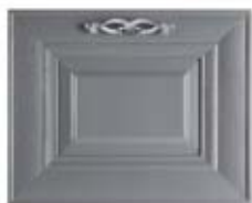
grigio titanio (opz. P43P) titanium grey