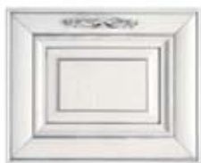
bianco ghiaccio (opz. P05A) ice white